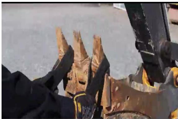
Attach the lifting eyes to the machine