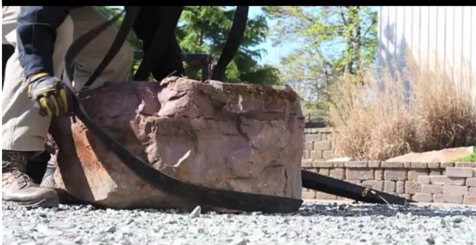
Engage the lift straps under the boulder

Position the slack lifting straps around the object, ensuring that the lift straps engage a “lip” on the bottom or side of the object. A bit of practice will allow you to find a “lip” that the BOULDER BUDDY can catch but not get trapped under making retraction of the system easy so you can move on to the next one!