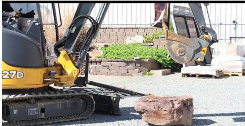
Align the bucket or forks with the boulder

The first step is to position the forks or bucket of your machine over the top of the boulder. Be aware of overhead hazards!